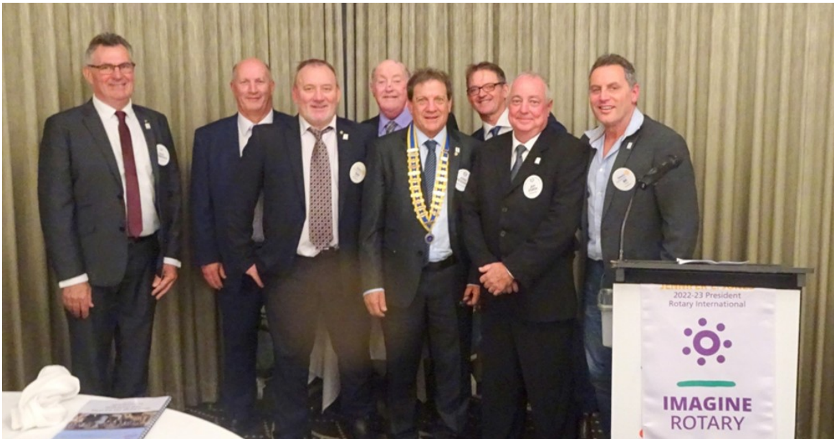
Rotary Club of Mackay West Board