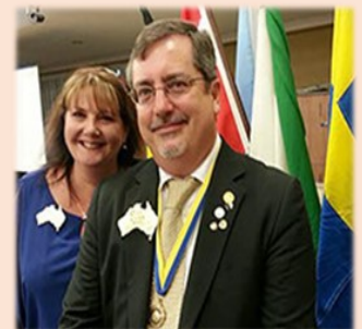
Governor Craig Winter PHS & Clare